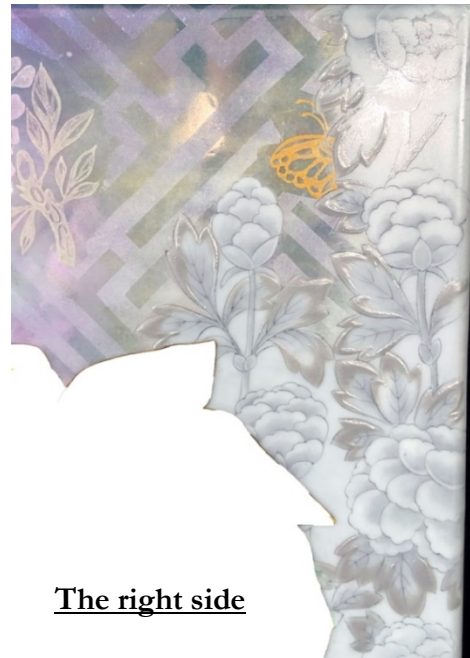
The right side

➤ Use brush and Iridescent colors of Green, Silver and Blue, paint the butterflies and flowers. Fire.