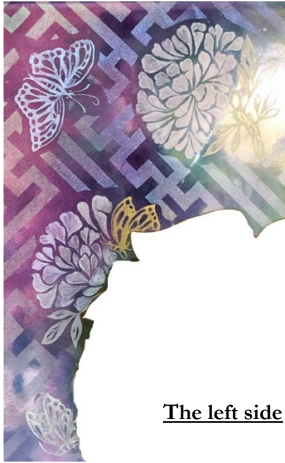
The left side

➤ Use brush and Iridescent colors of Green, Silver and Blue, paint the butterflies and flowers. Fire.