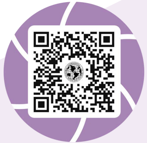
Scan for IPAT Video Lesson Library

Visit www.ipatinc.org/zoom-library or scan the QR code to go to the video library.